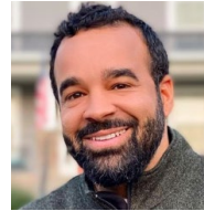
Creative Communications Manager