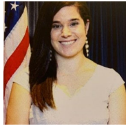
Strategic Communications Manager

* Also serves on EOC's Joint Information System