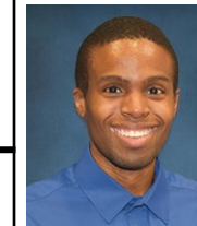
Social Media Strategist