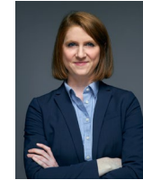
Editorial & Media Relations Manager