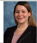
Language Access Coordinator